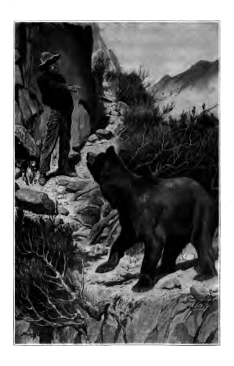
"I'd hate to have to spile your hide, but I'll do it if you don't get out o' this trail"